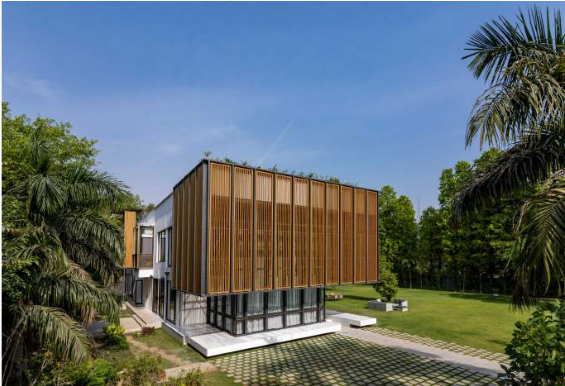
Farmhouse, New Delhi