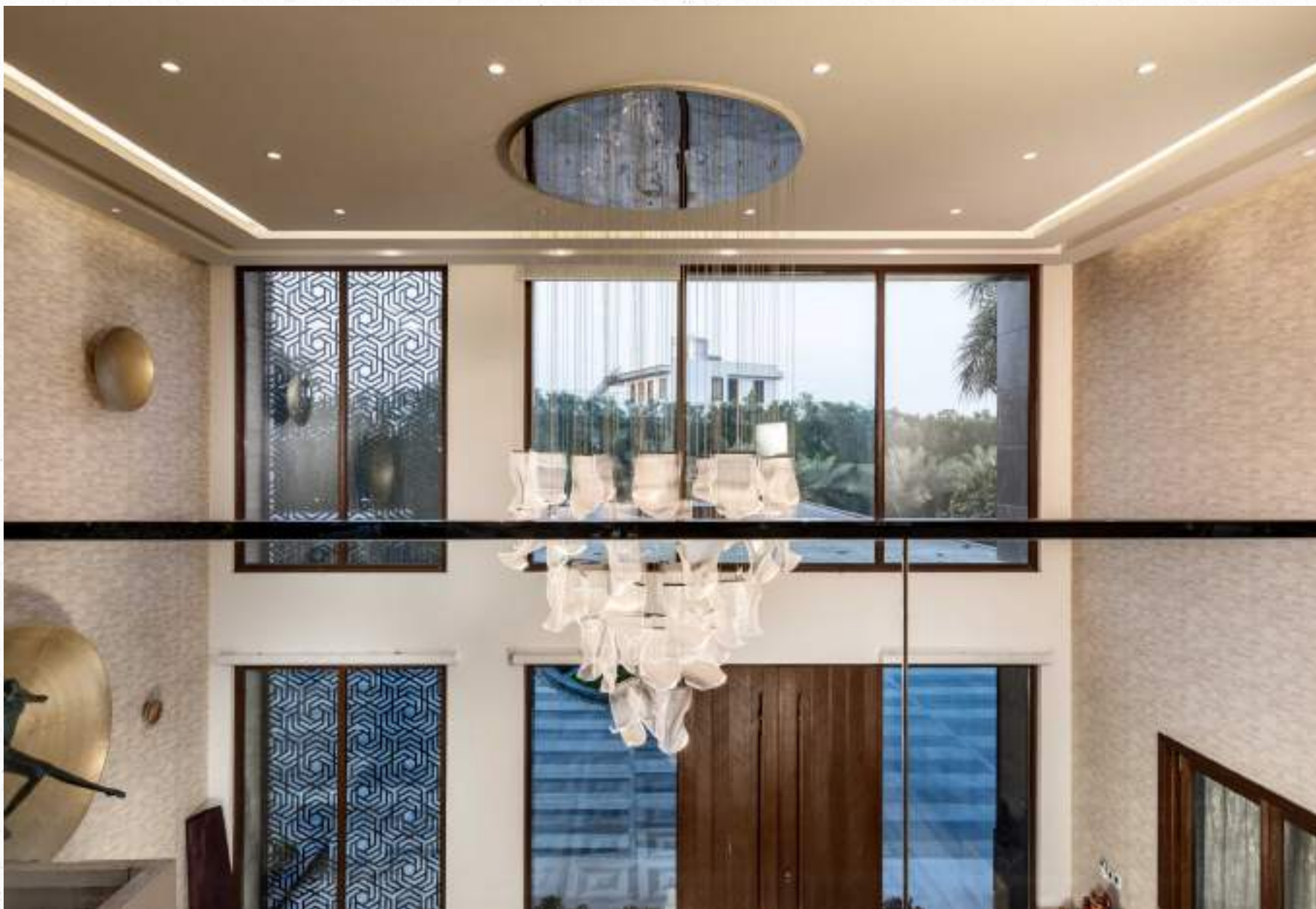
Farmhouse, New Delhi