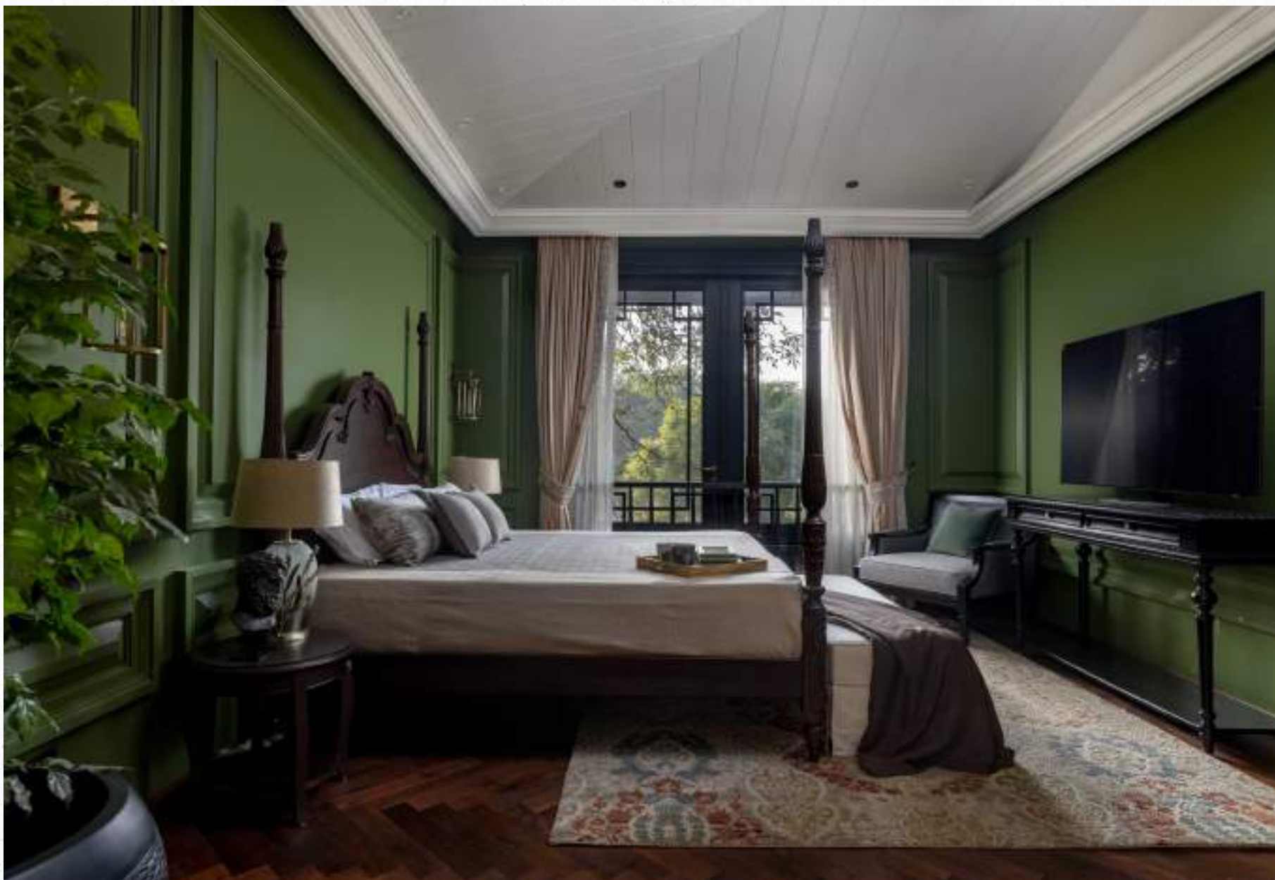
Farmhouse, New Delhi