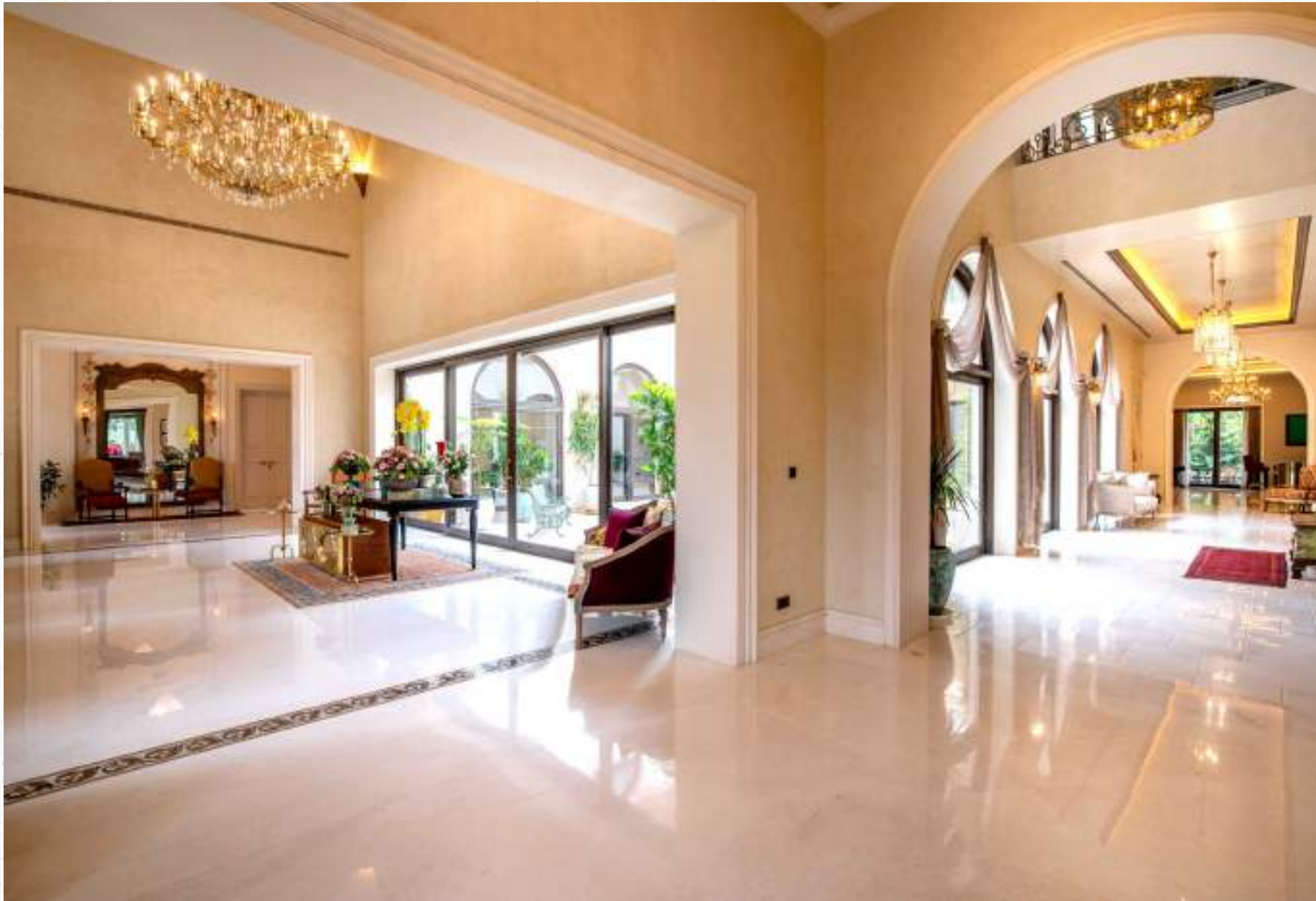
Palatial House, Hyderabad