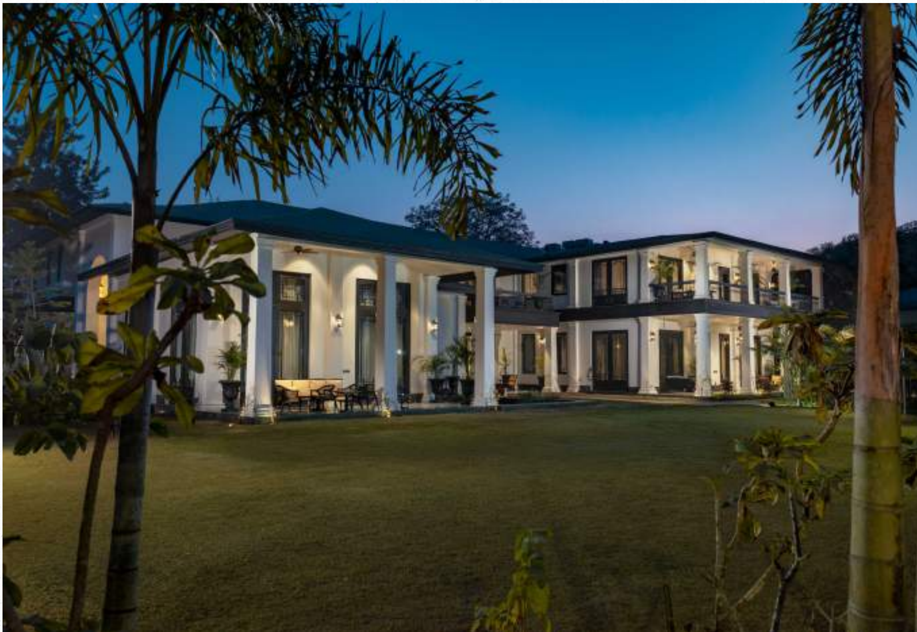
Farmhouse, New Delhi