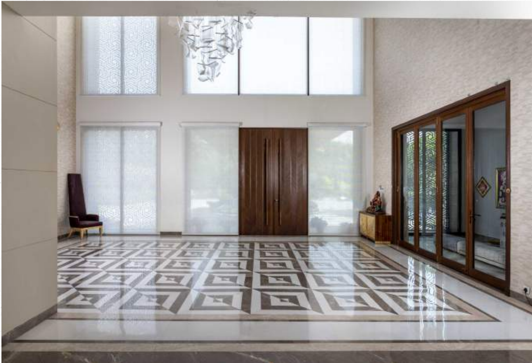
Farmhouse, New Delhi