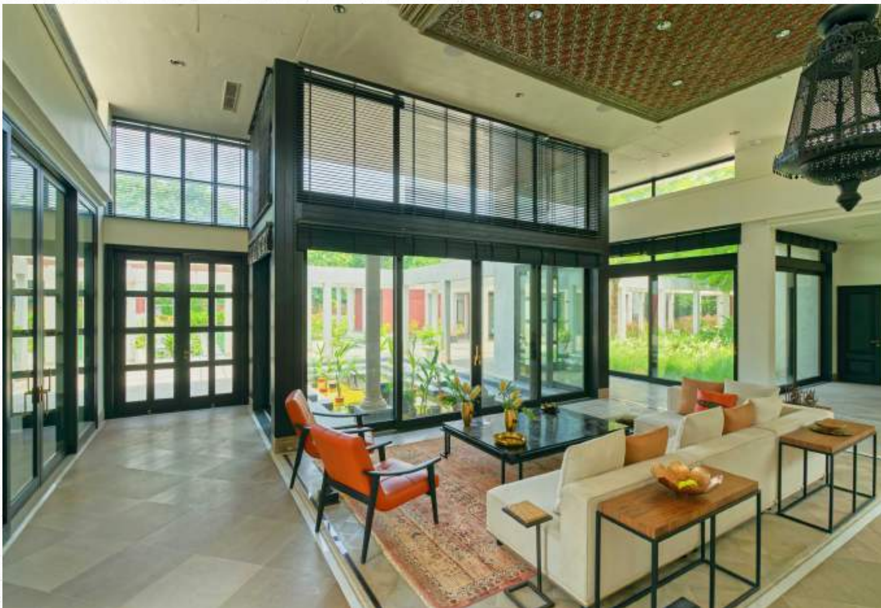
Farmhouse, New Delhi