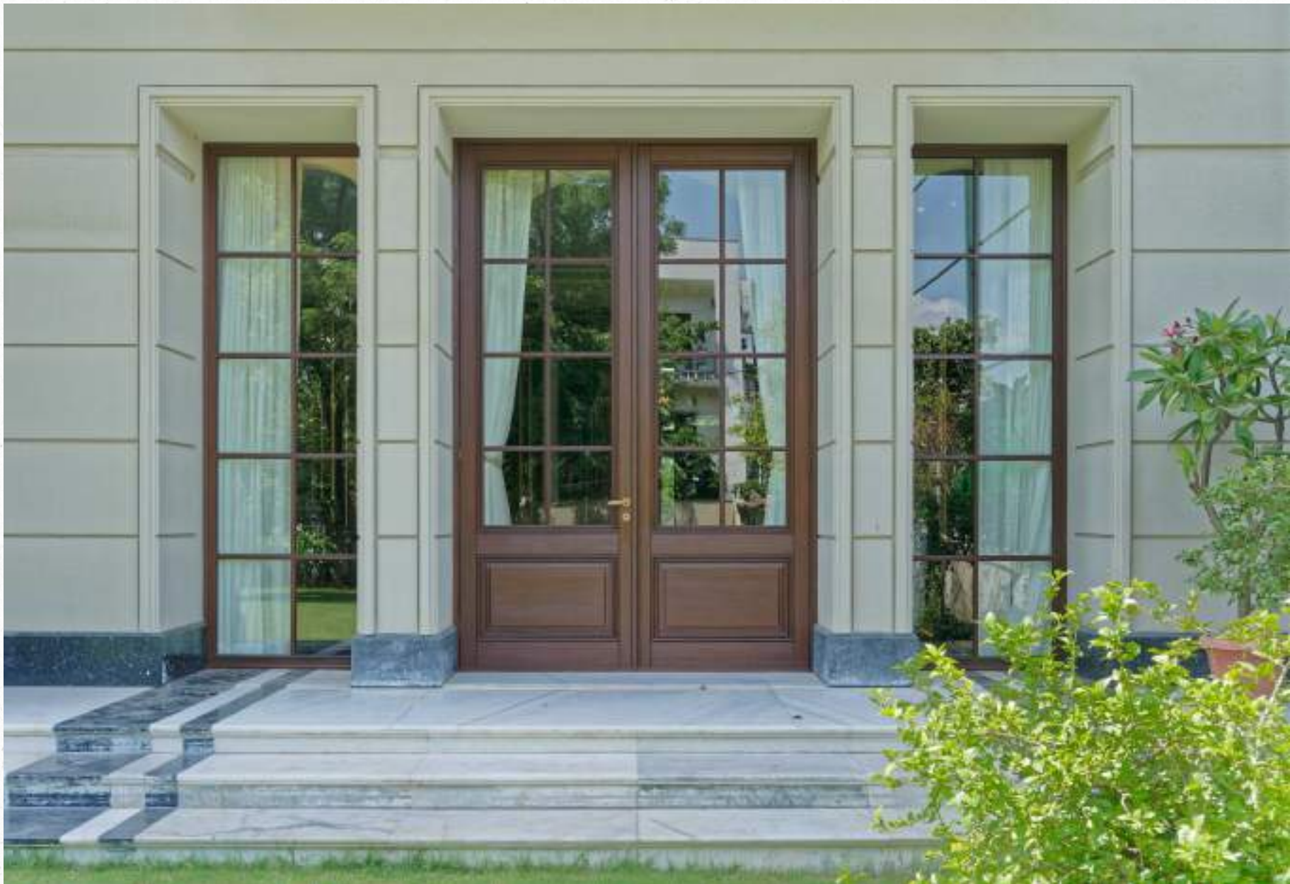
Classical Style Bungalow in New Delhi