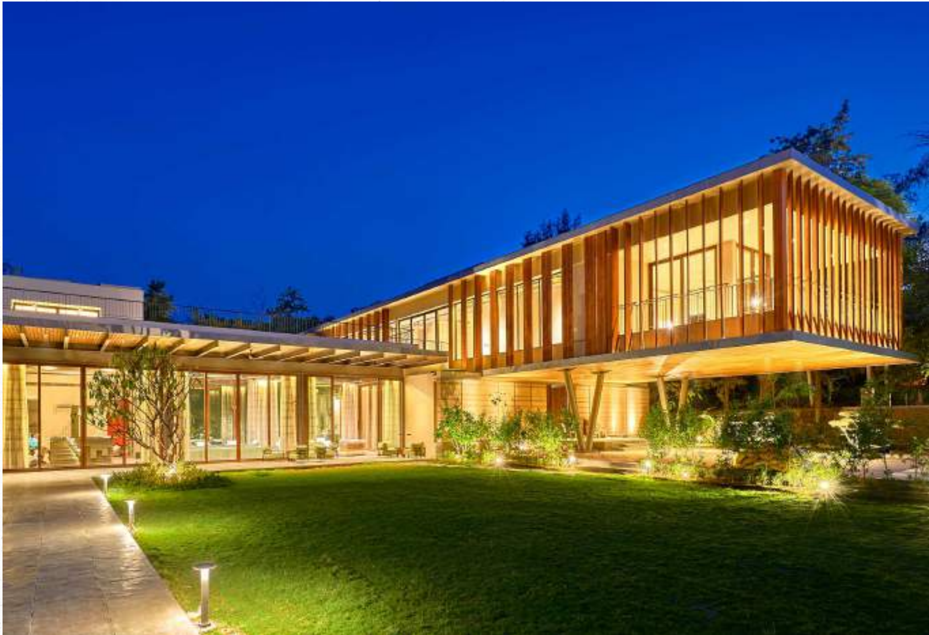
Vacation Home, City Outskirts