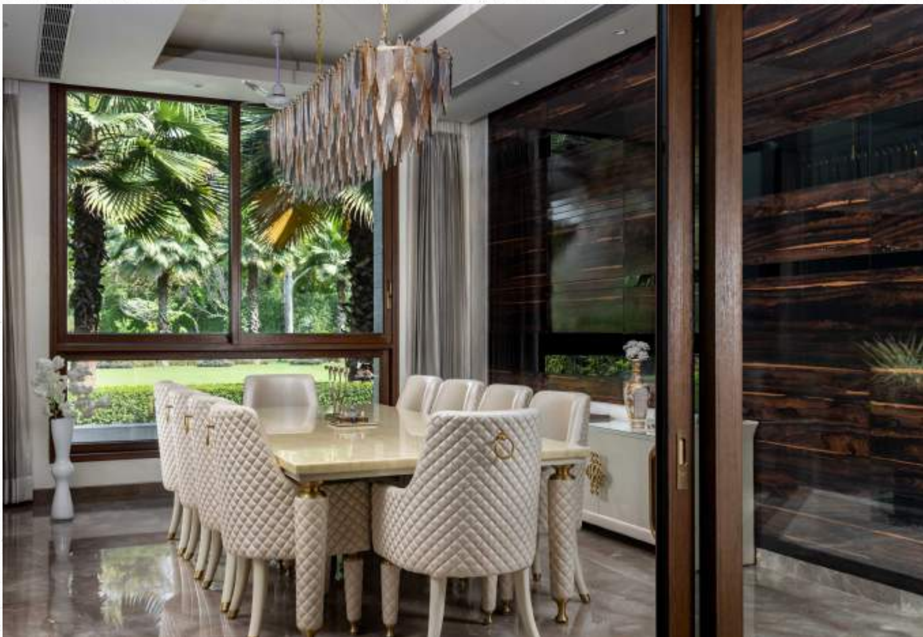
Farmhouse, New Delhi