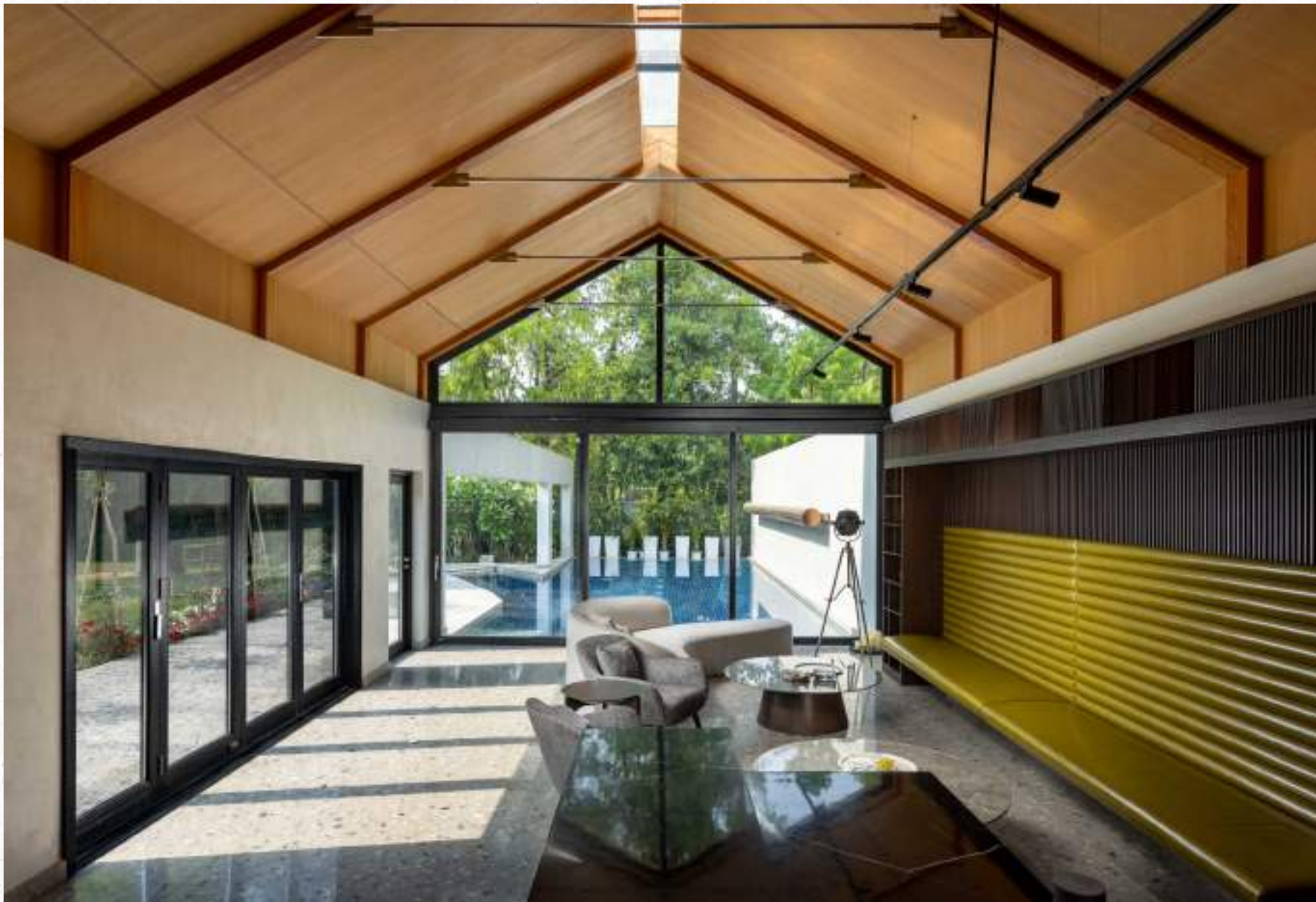
Farmhouse, New Delhi