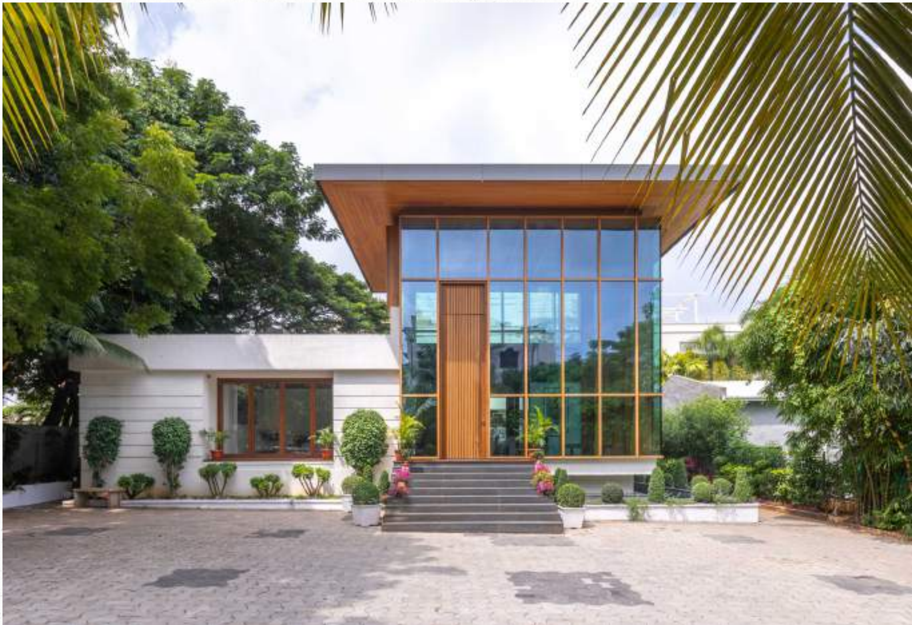
Artius Experience Centre, Hyderabad