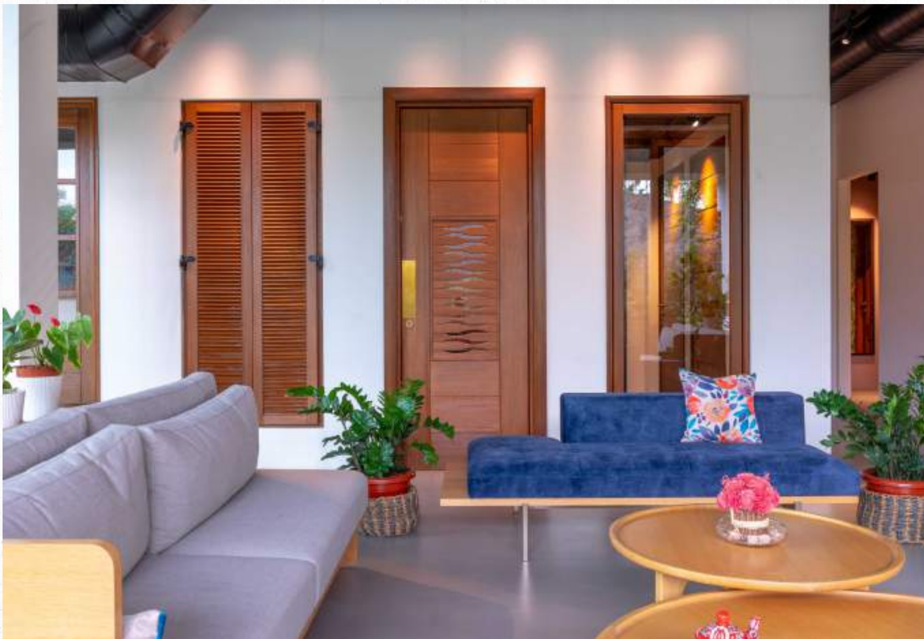
Artius Experience Centre, Hyderabad