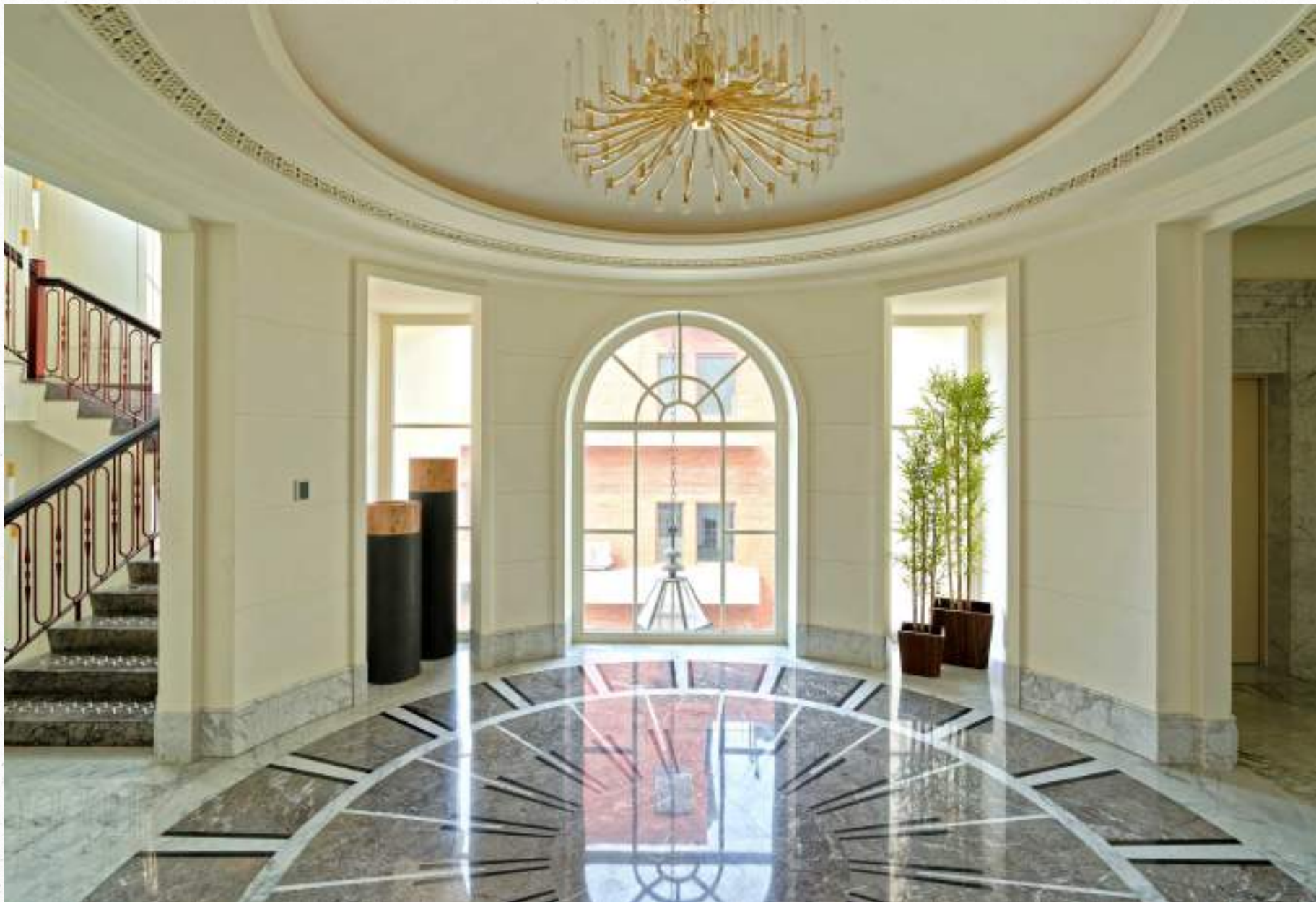
Lutyens Style Bungalow in New Delhi