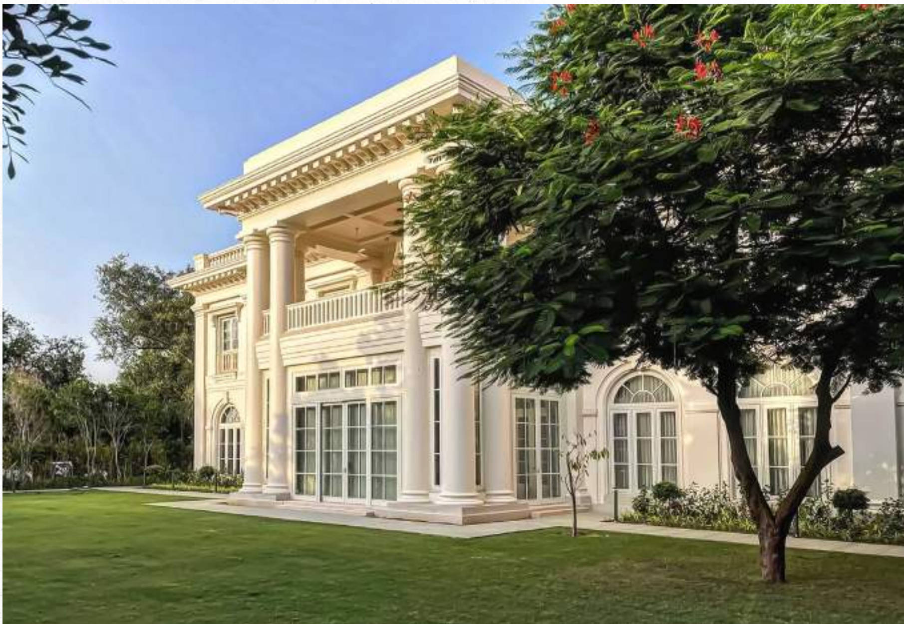
Lutyens Style Bungalow in New Delhi