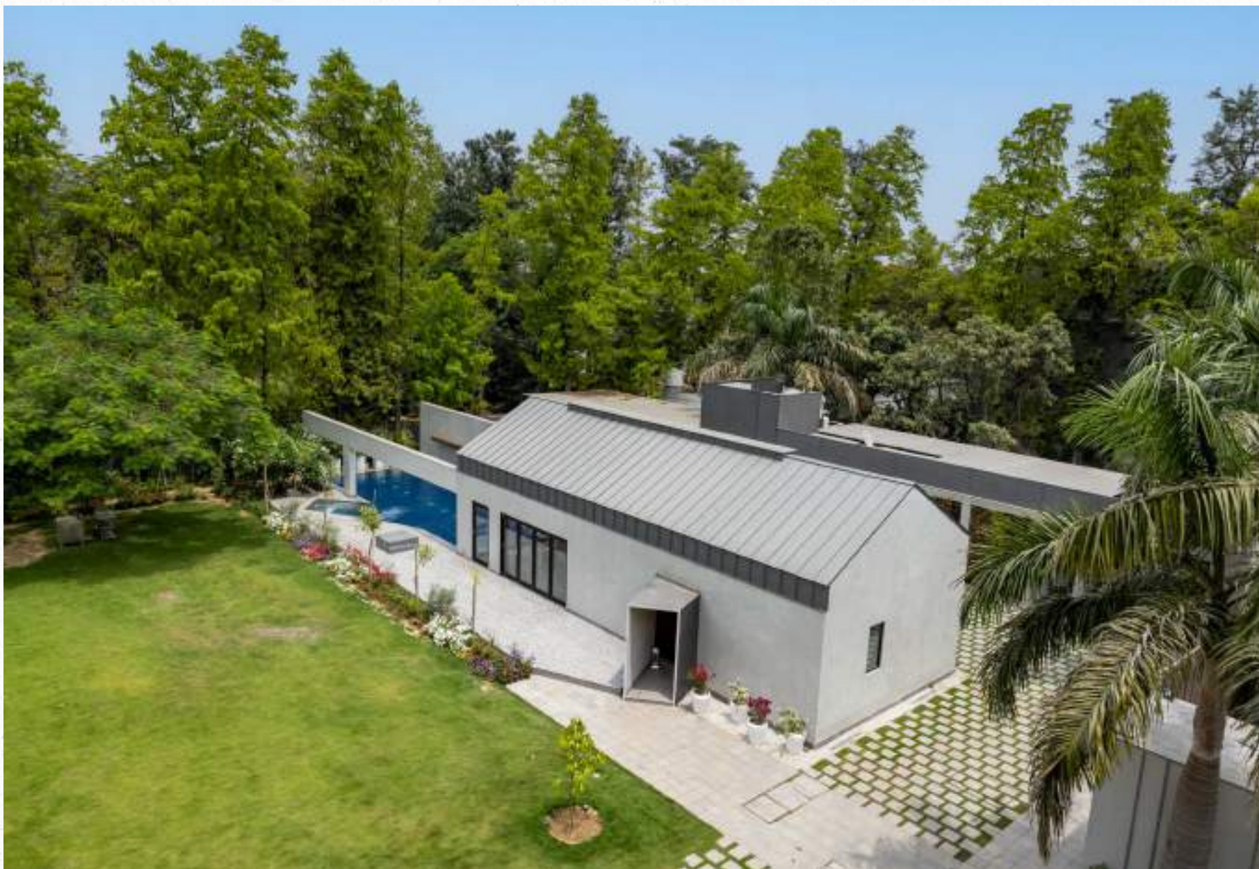
Farmhouse, New Delhi