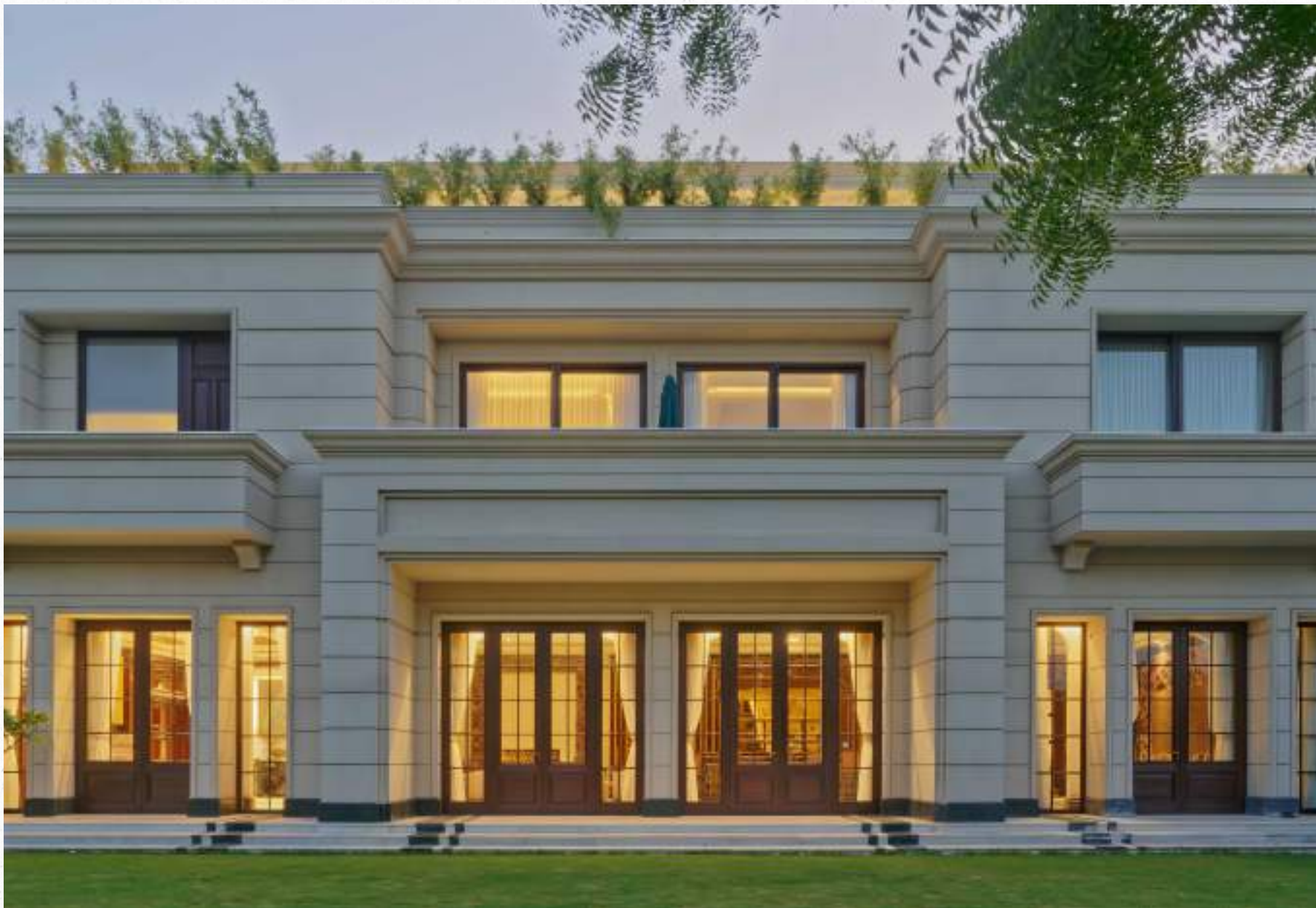
Classical Style Bungalow in New Delhi