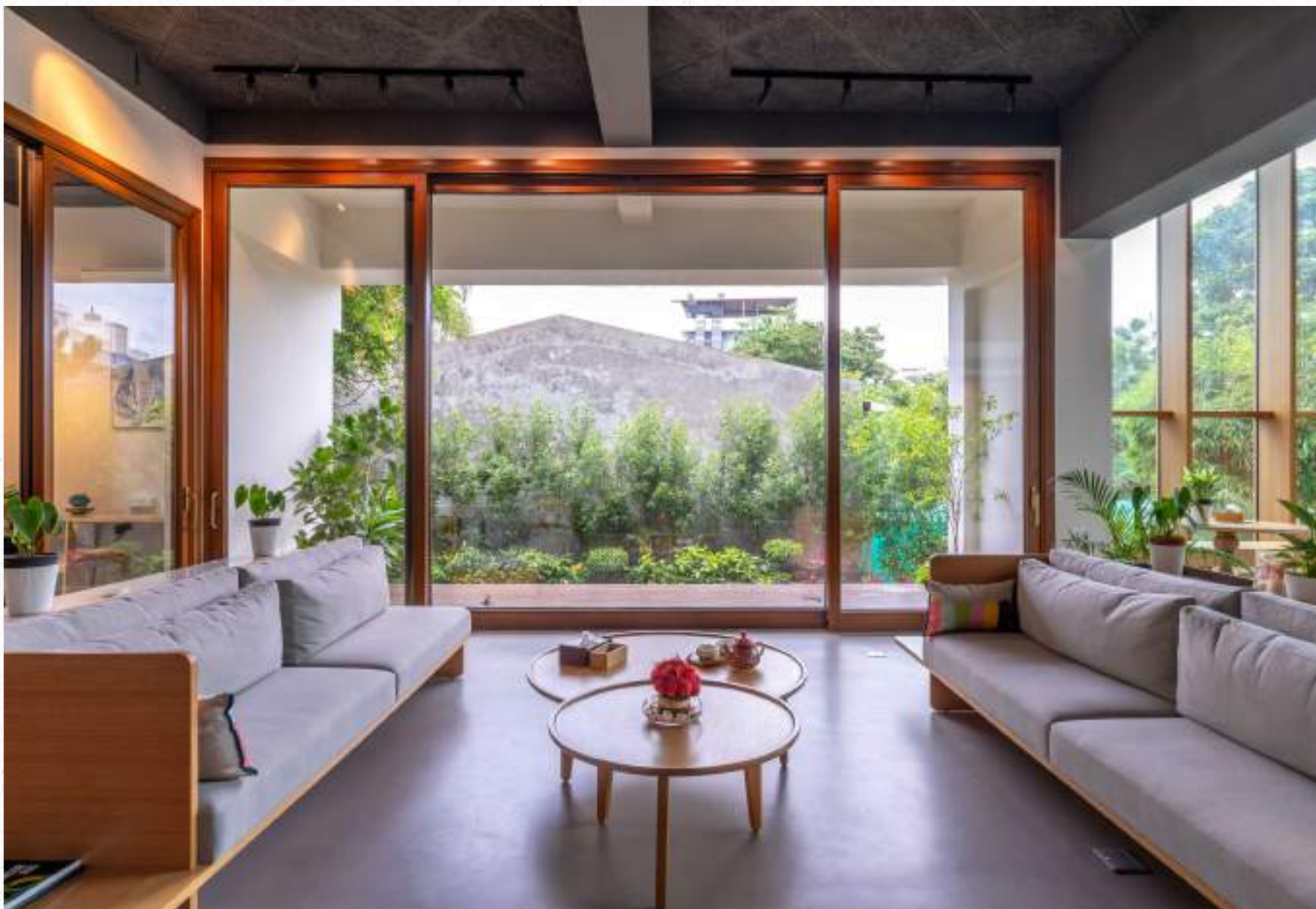
Artius Experience Centre, Hyderabad