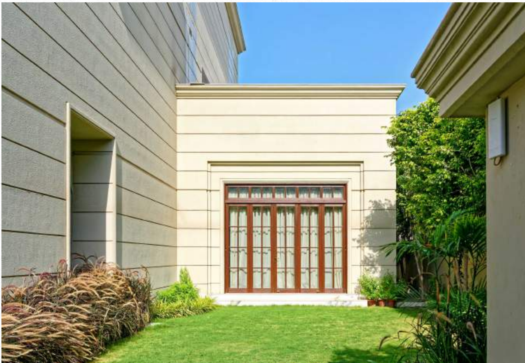
Classical Style Bungalow in New Delhi