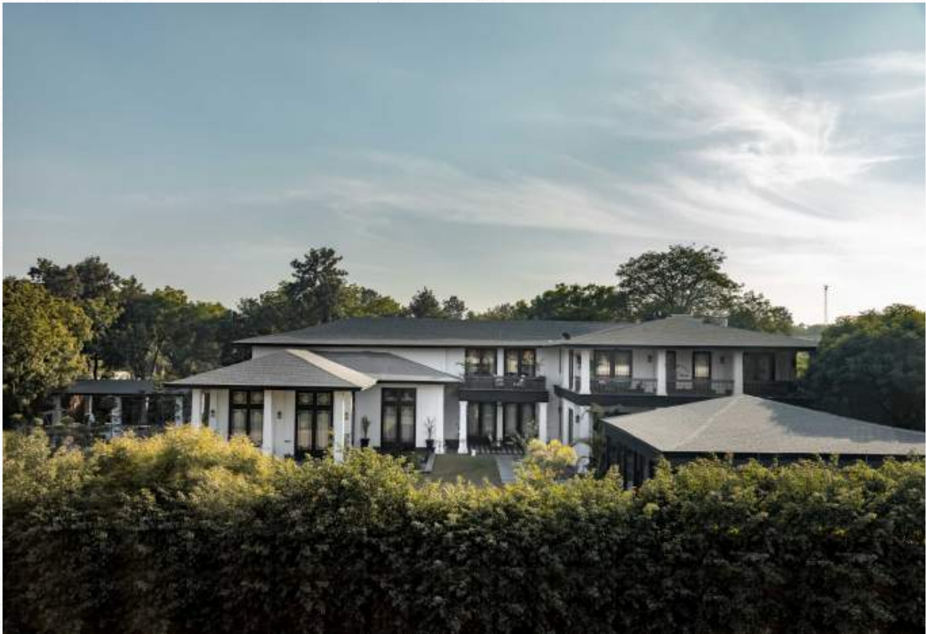
Farmhouse, New Delhi