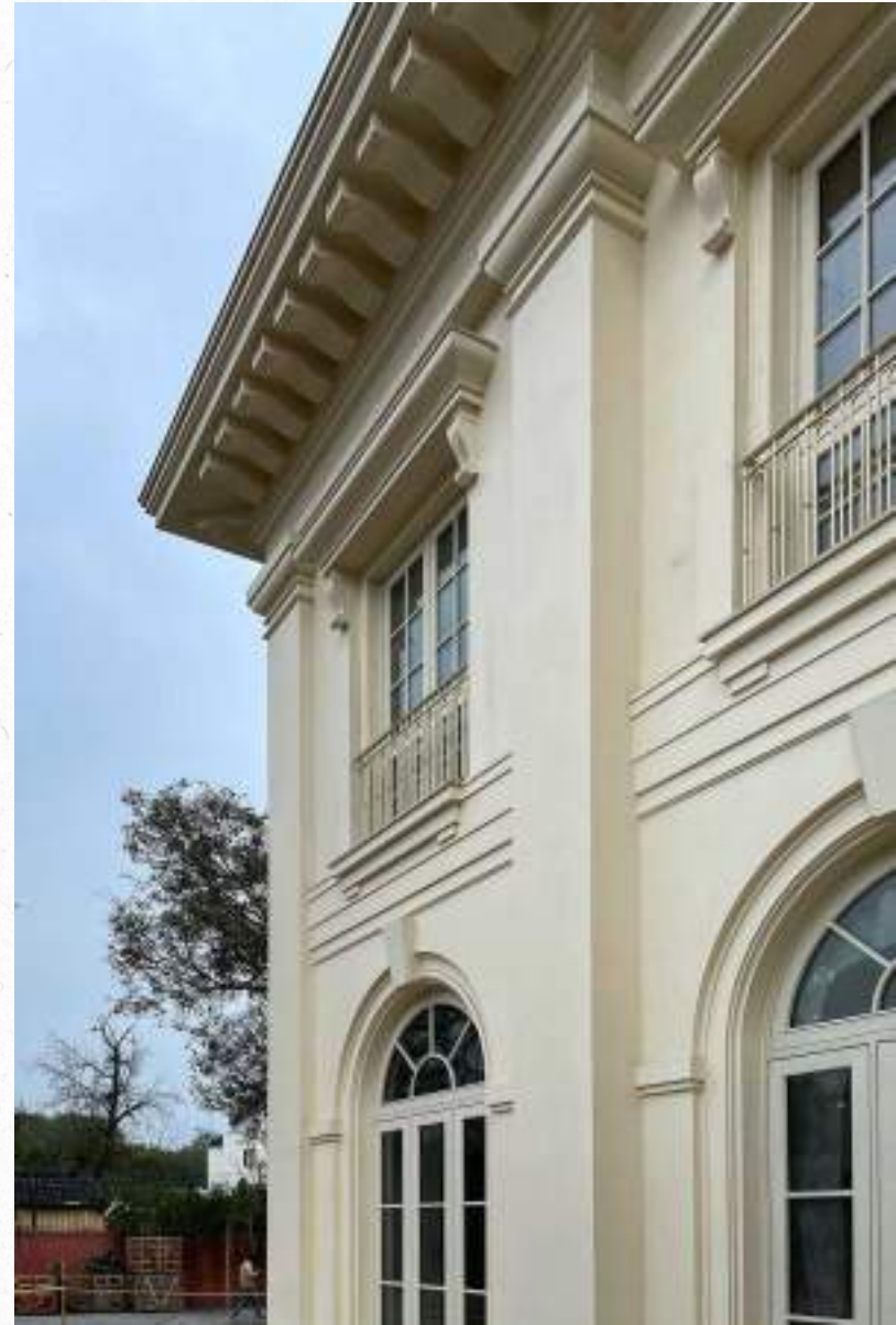
Lutyens Style Bungalow in New Delhi