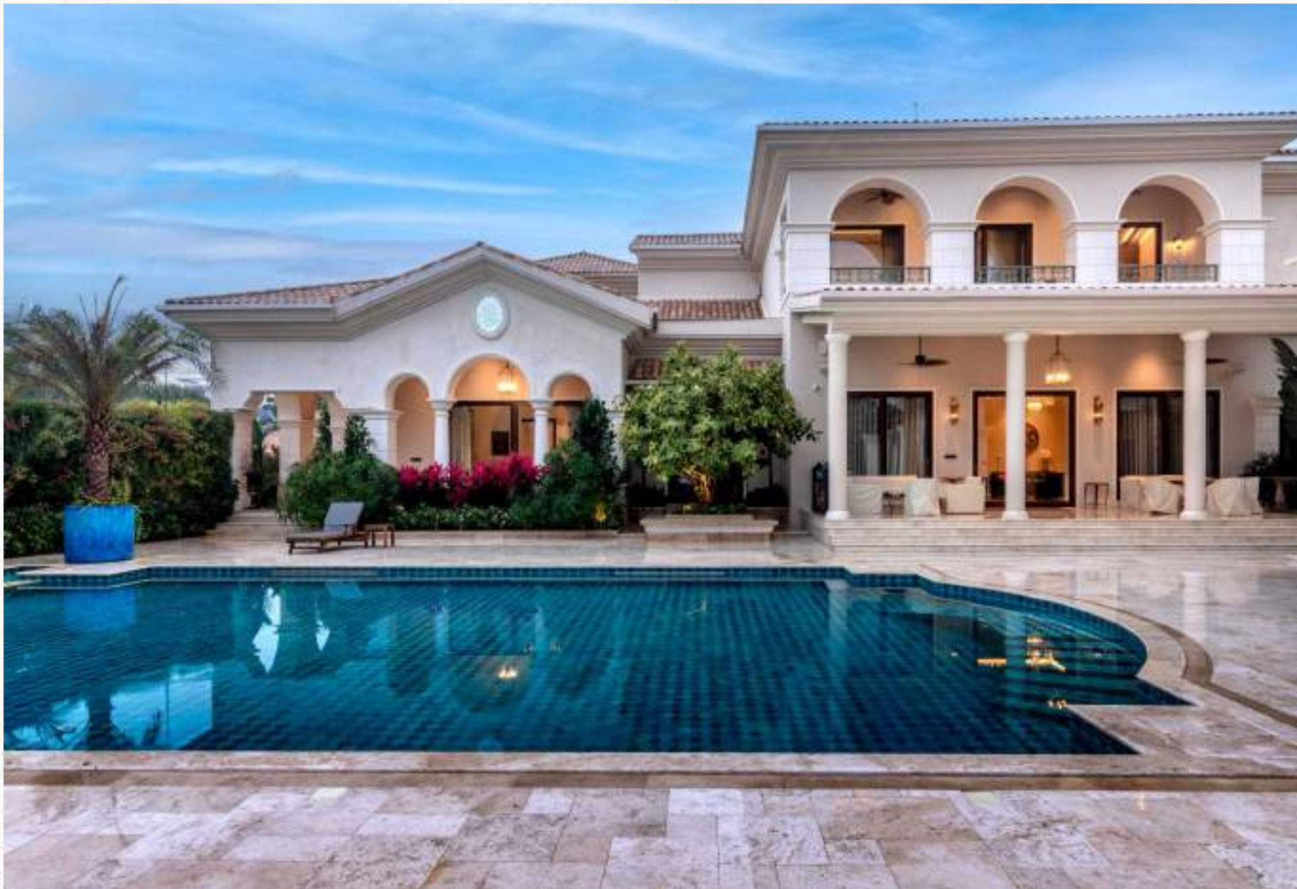
Palatial House, Hyderabad