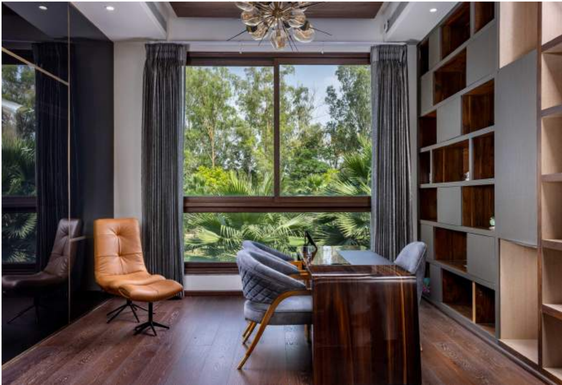
Farmhouse, New Delhi