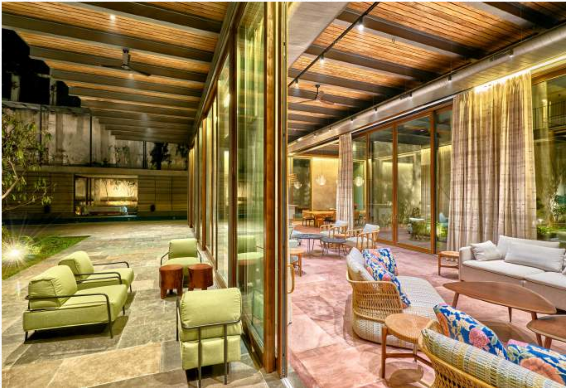
Vacation Home, City Outskirts