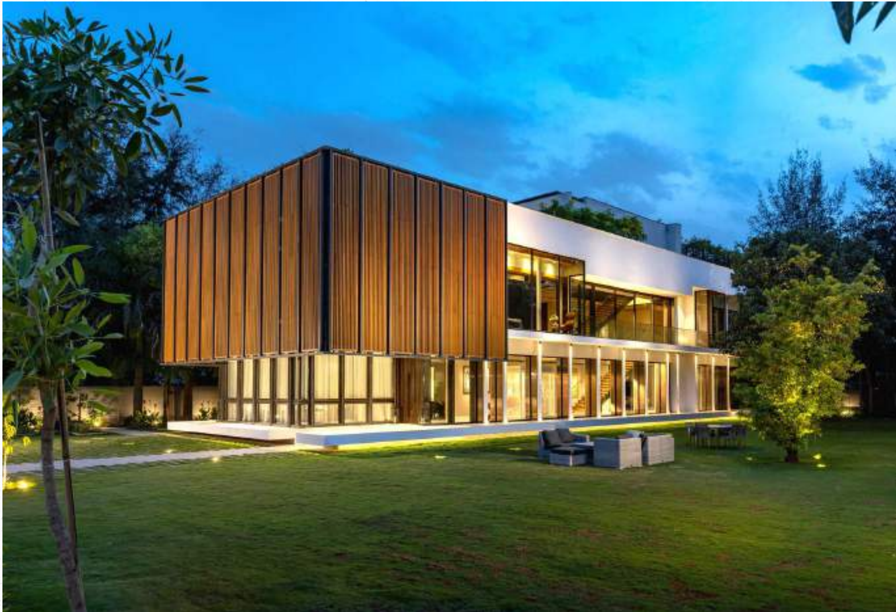
Farmhouse, New Delhi