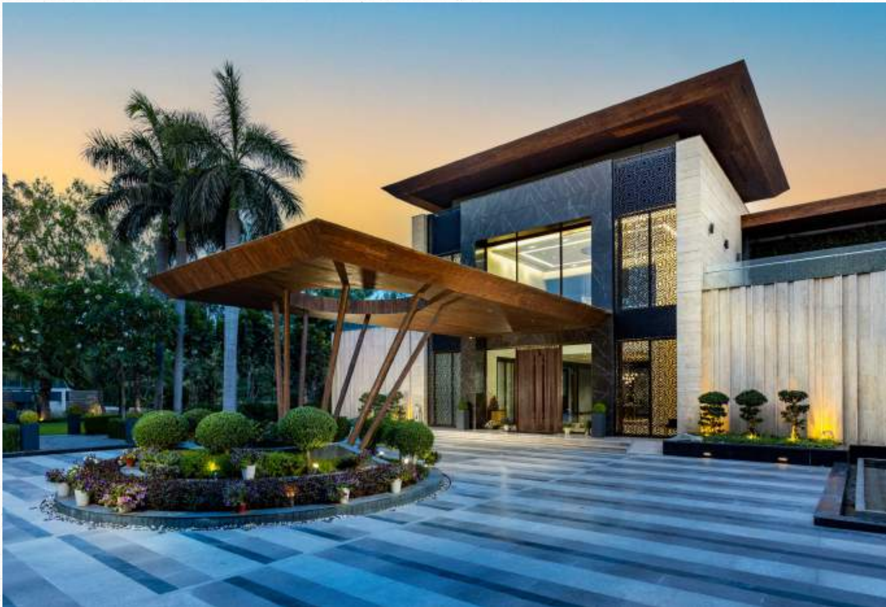
Farmhouse, New Delhi