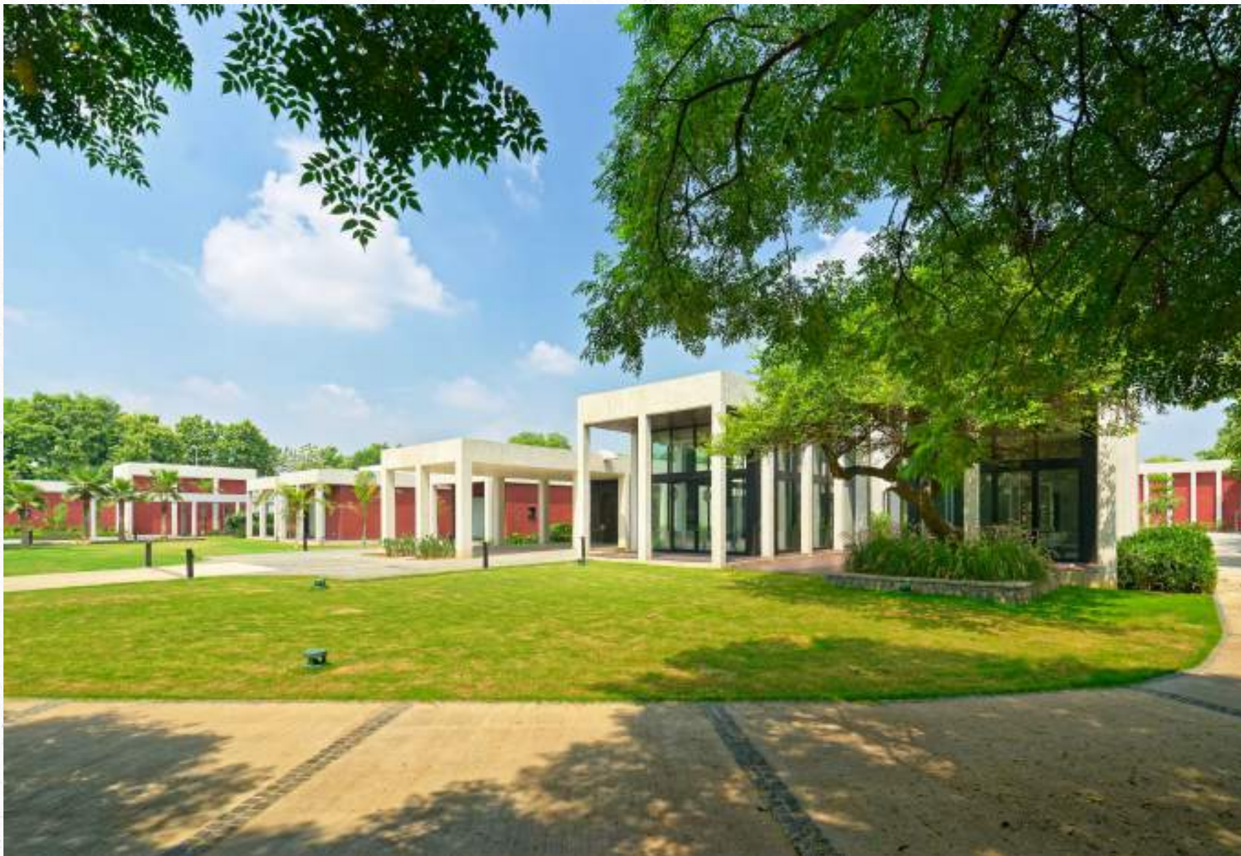
Farmhouse, New Delhi