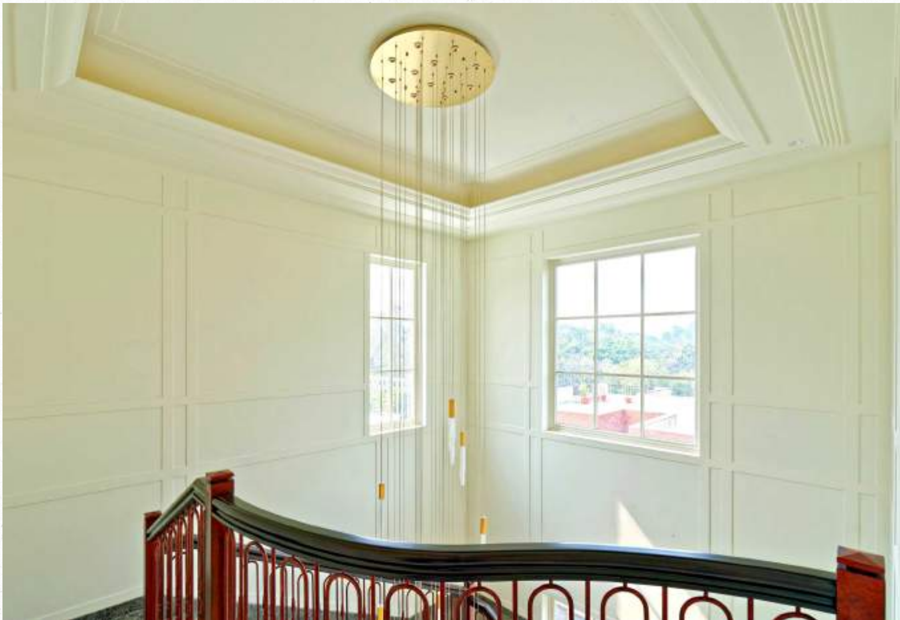
Lutyens Style Bungalow in New Delhi