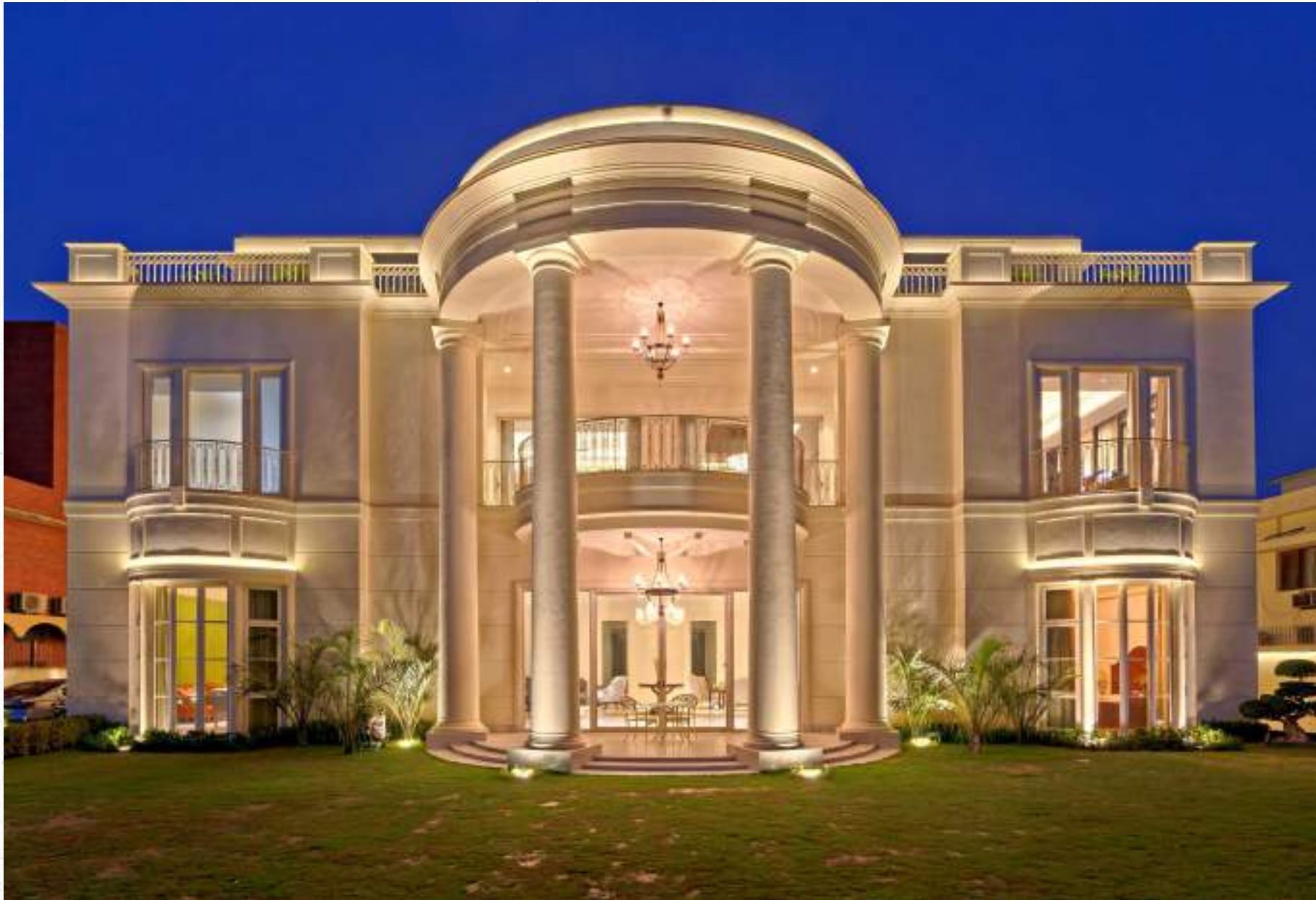
Lutyens Style Bungalow in New Delhi