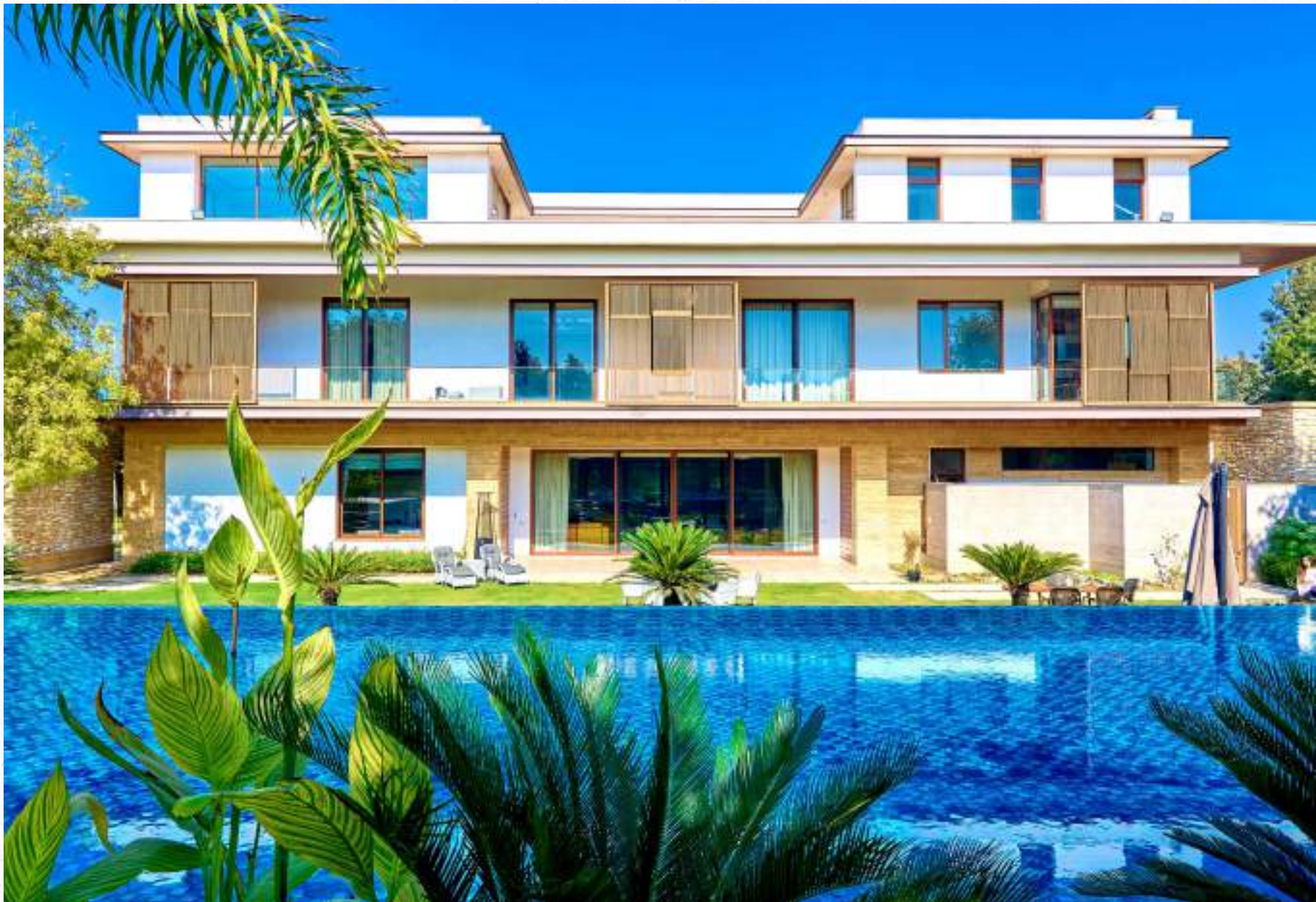
Farm House , Sultanpur, New Delhi