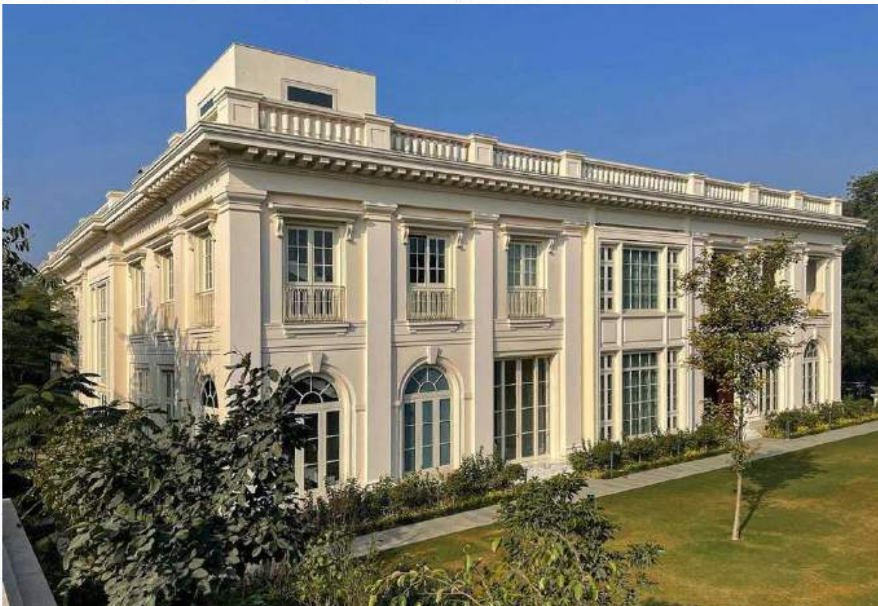
Lutyens Style Bungalow in New Delhi