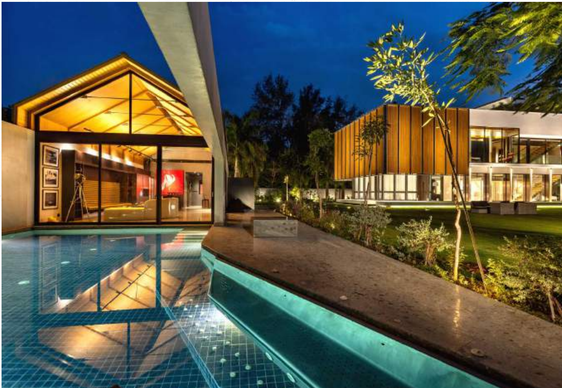
Farmhouse, New Delhi