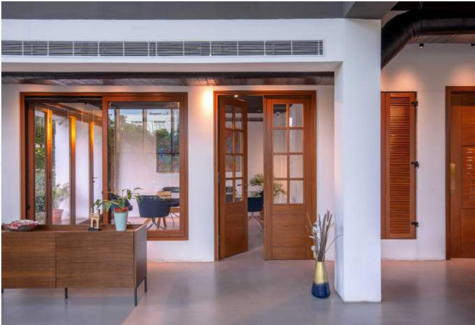
Artius Experience Centre, Hyderabad