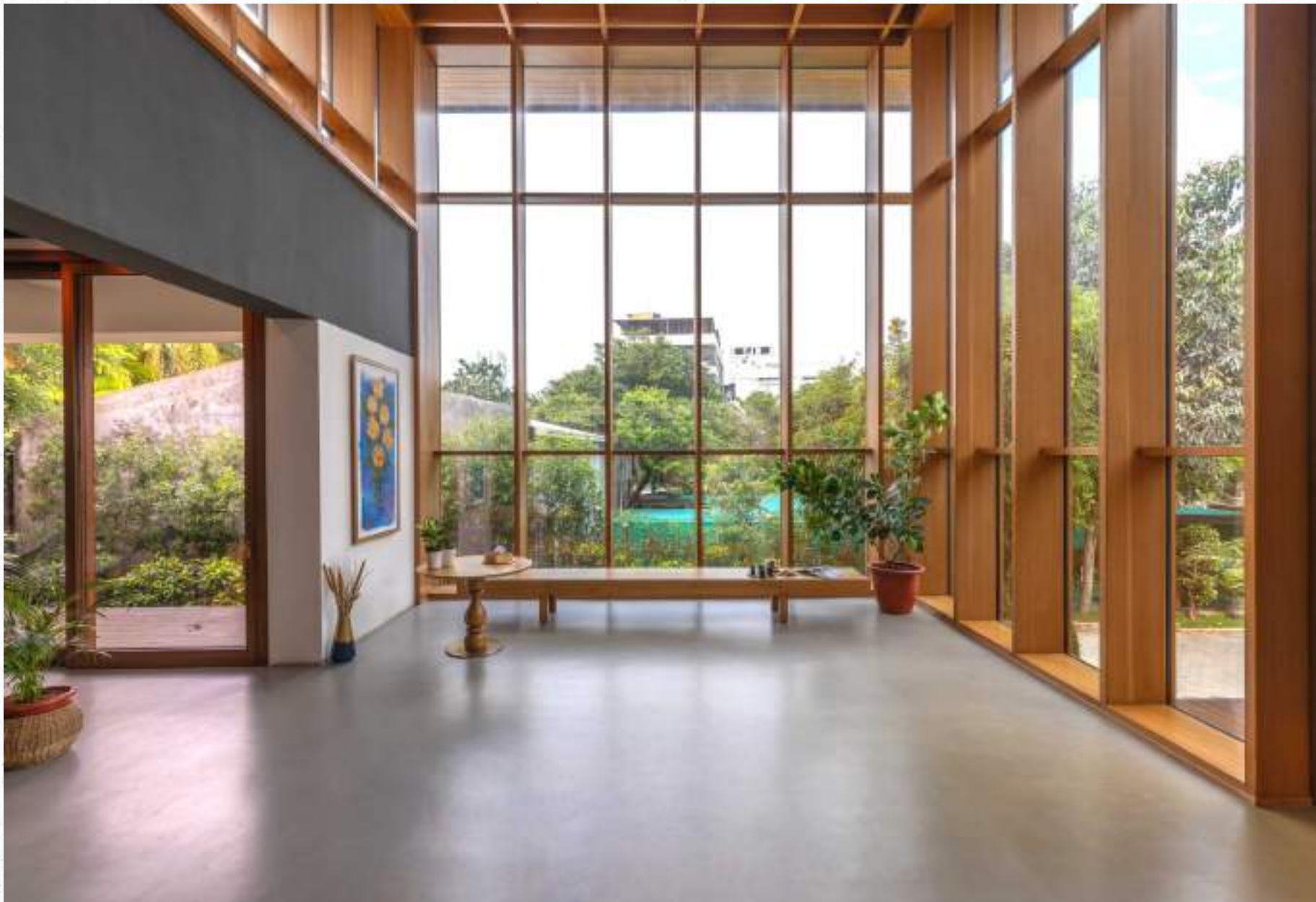
Artius Experience Centre, Hyderabad