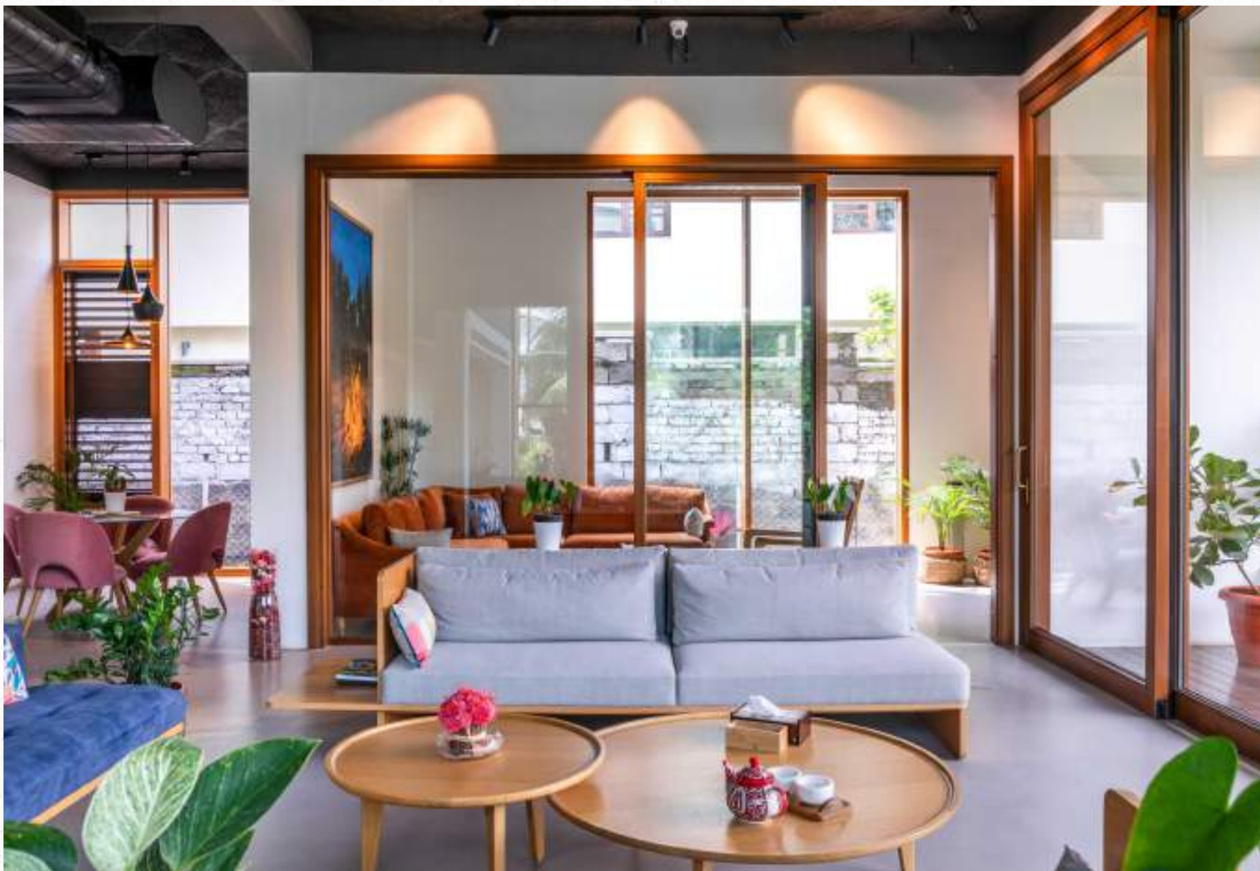
Artius Experience Centre, Hyderabad