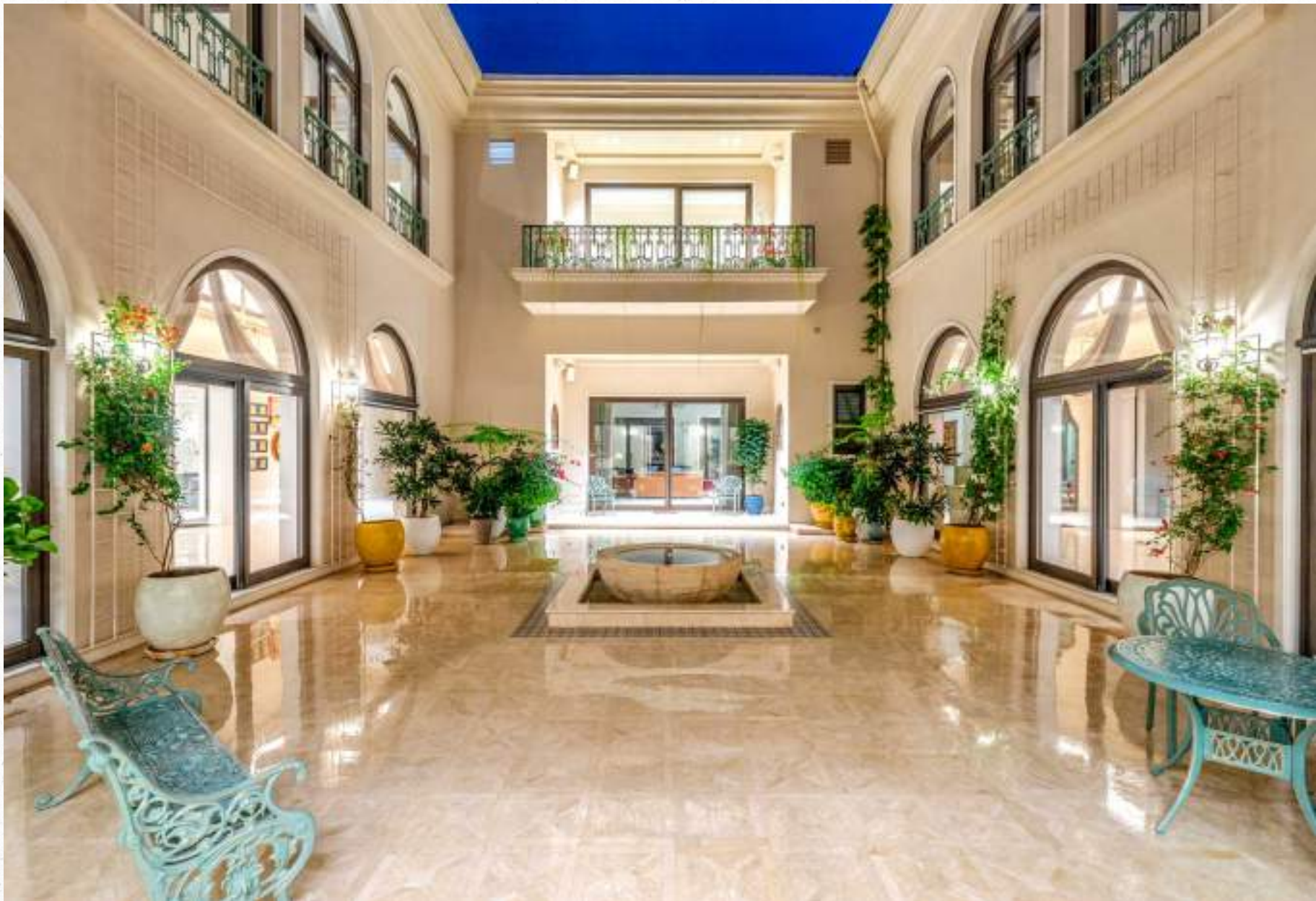
Palatial House, Hyderabad