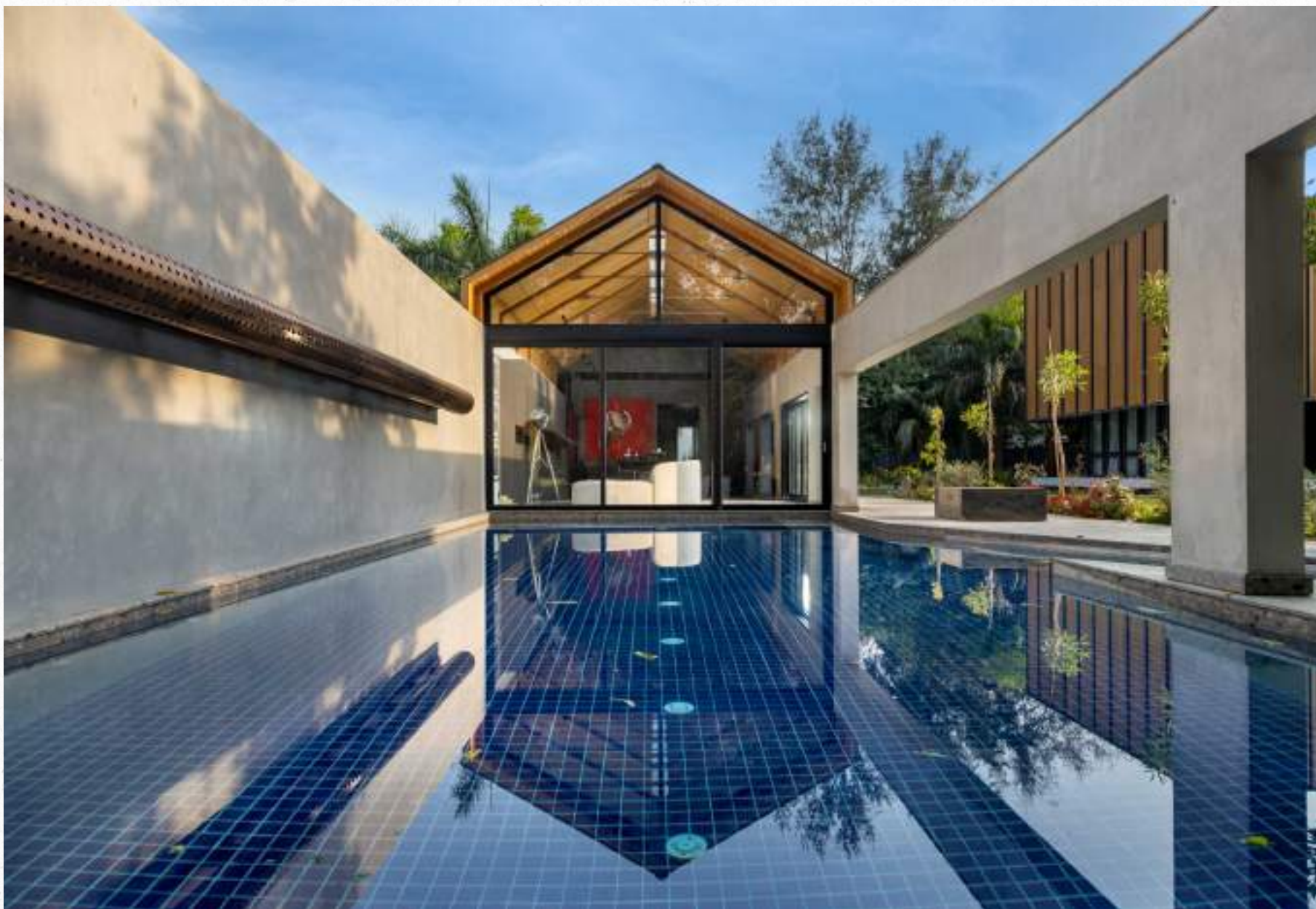
Farmhouse, New Delhi