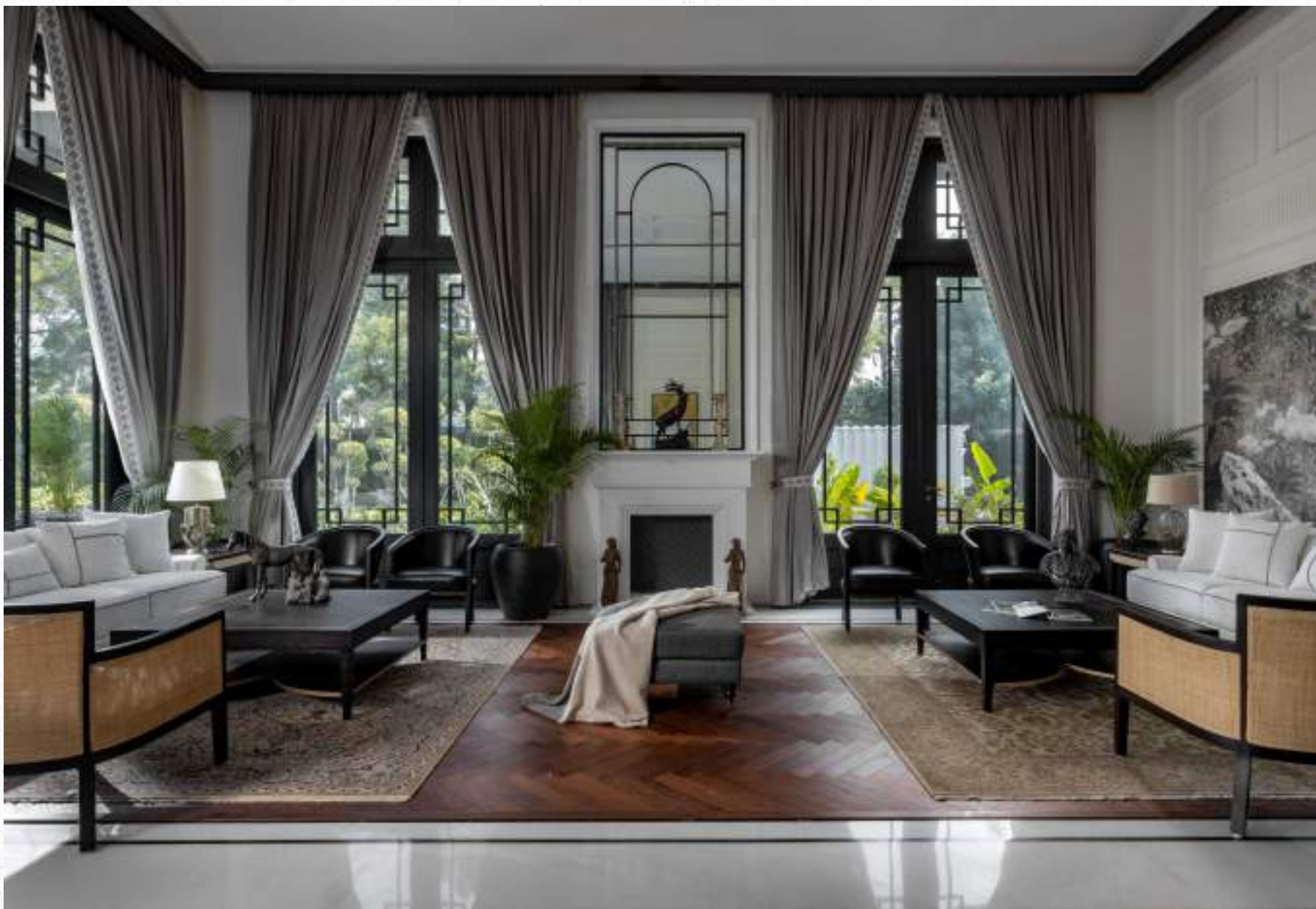
Farmhouse, New Delhi