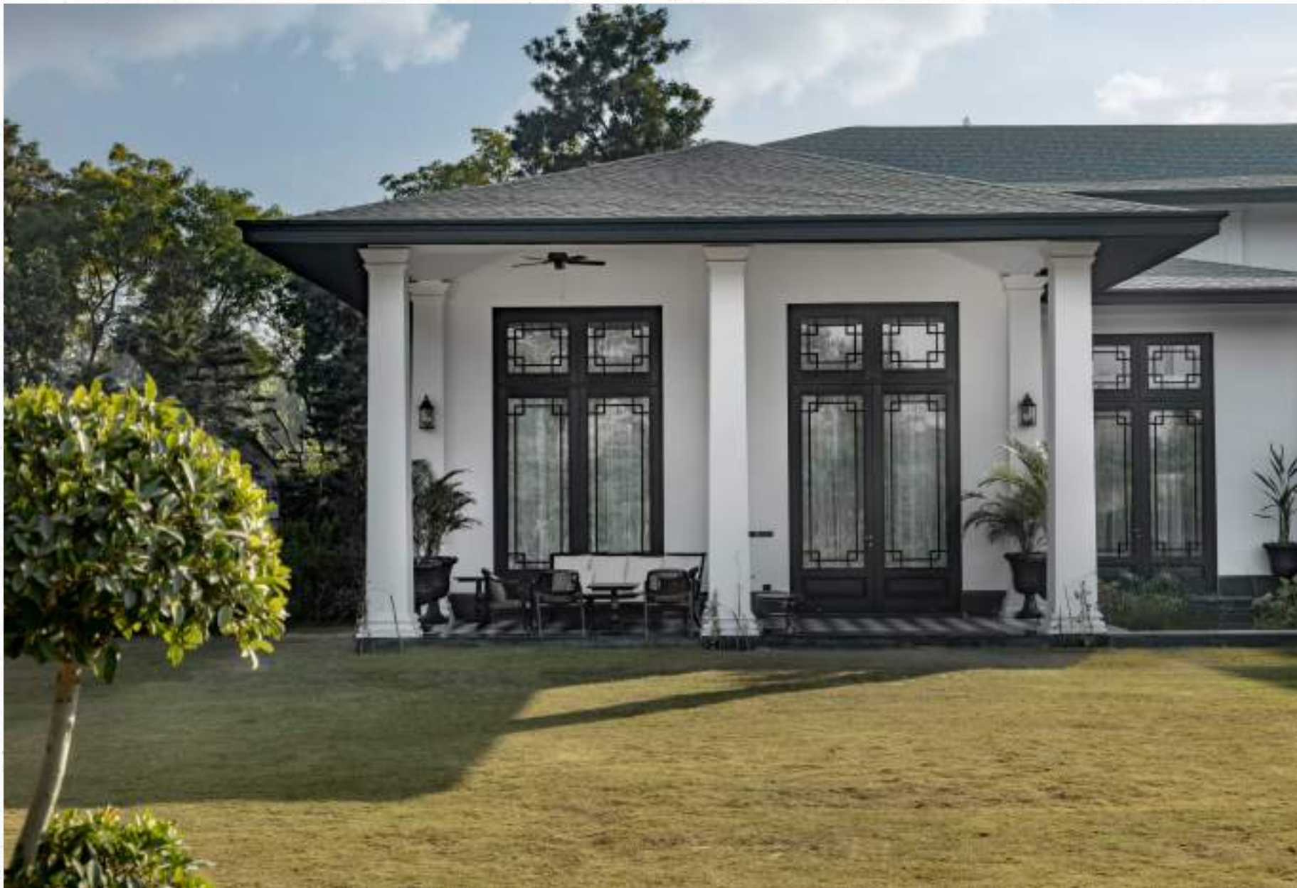
Farmhouse, New Delhi