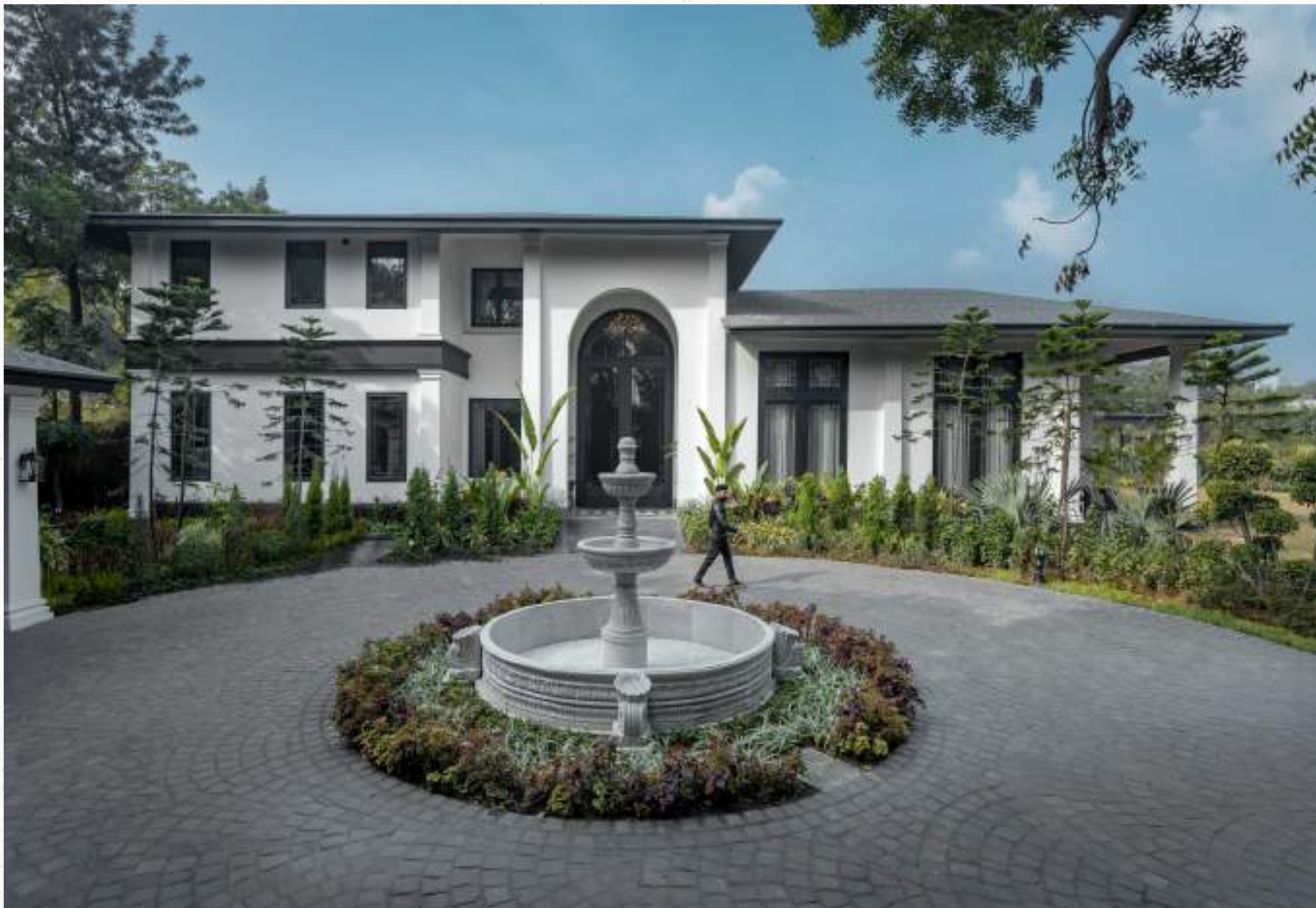
Farmhouse, New Delhi