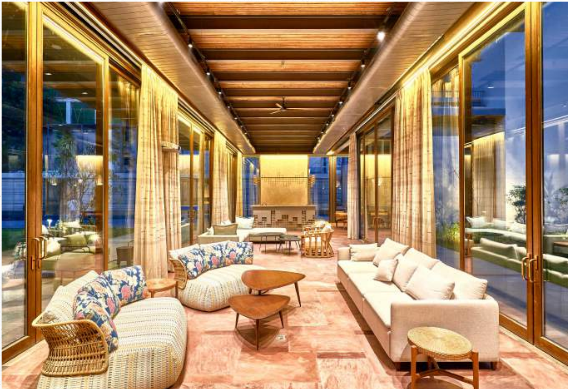
Vacation Home, City Outskirts