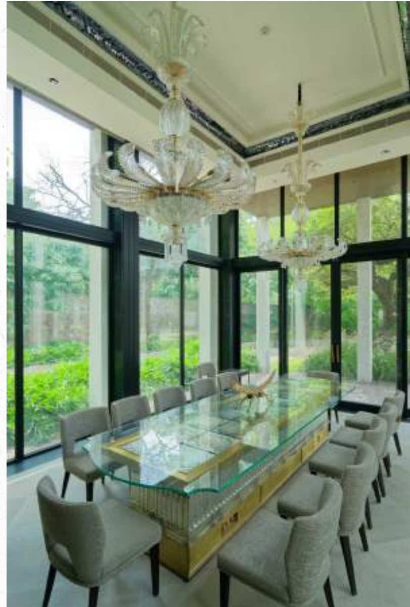
Farmhouse, New Delhi