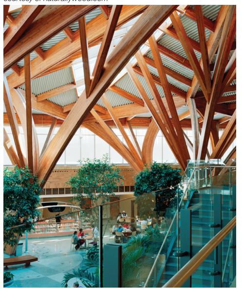
Credit Valley Hospital in Mississauga, Ontario, is one of an increasing number of healthcare facilities making use of exposed wood to create a warm, natural aesthetic that supports their healing objectives.

Photo by Peter Sellar, Tye Farrow of Farrow Partnership, courtesy of naturallywood.com