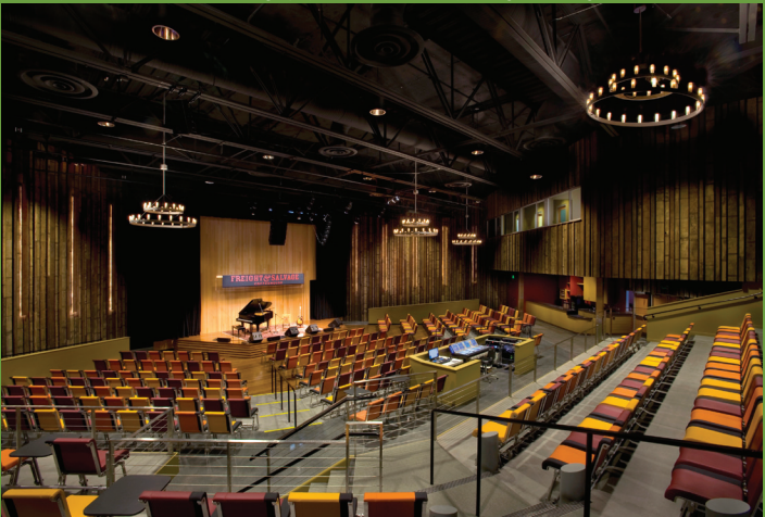
Freight & Salvage Coffeehouse, Berkeley, California