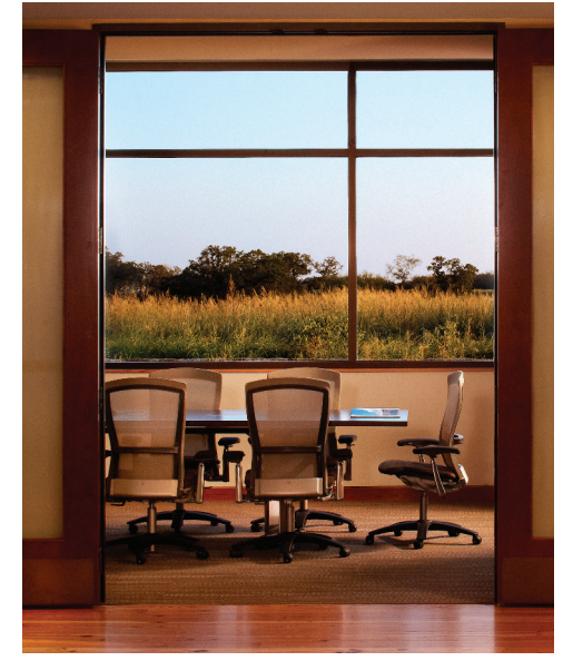
Research is confirming that interiors with natural materials and views, exemplified here in the Greater Texas Foundation in Bryan, Texas, can lower stress and promote relaxation.