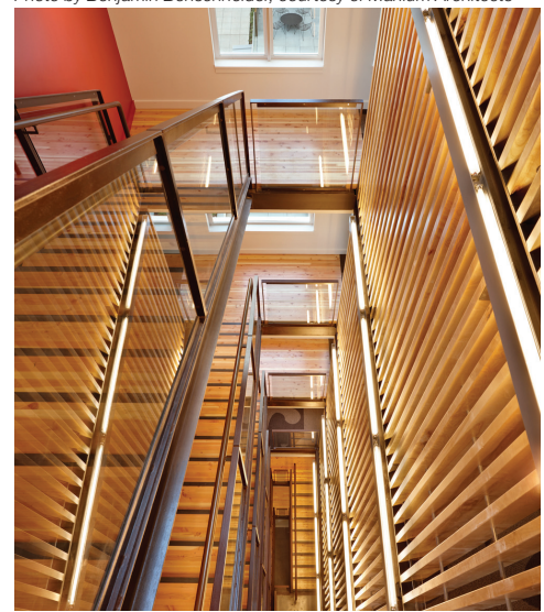
One of the many innovative uses of wood on the exterior and interior of new student housing at the University of Washington in Seattle.