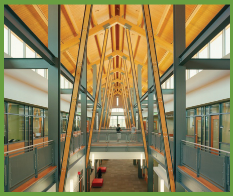
El Dorado Conference Center El Dorado, Arkansas

Photo by Peter Sellar, Tye Farrow of Farrow Partnership, courtesy of naturallywood.com