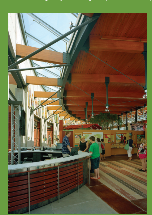
Heifer International Murphy Keller Education Center Little Rock, Arkansas

Highlighting the thread of 'honest structural expression' throughout these projects, the main anchor of the Heifer International Murphy Keller Education Center is a 2-foot-thick curved concrete wall, representing the barrier between industrialized nations and the world where the majority of humans live. Floating lightly from the wall, a timber roof, supported by glulam beams, is freed and separated by a continuous skylight, reflecting light onto the wall and exhibits. Maple-slatted walls hide air grilles, provide a means to hang exhibits and reduce sound reverberation. The exhibit space extends to a giant wood porch, where tree columns branch out, gently touching the pine roof canopy, extending the forest into the building form.